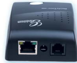
Analog Telephone Adaptor Plug & Ring Ready

Consumers have many options for home phone service and they can all seem the same: a phone number, unlimited domestic calling, an adapter device, and a price around $25. Teleworld includes some valuable differences. With Teleworld you can keep your own number and there is no setup or porting fees. With Teleworld you not only get unlimited domestic US and Canada calling but unlimited calling worldwide – nearly 70 countries. With Teleworld you get an adapter for free and it arrives pre-configured – plug & ring ready. Even with all of these differences, Teleworld is about 25% less expensive per month than many other providers. What makes Teleworld different is simply that it's a better overall value.